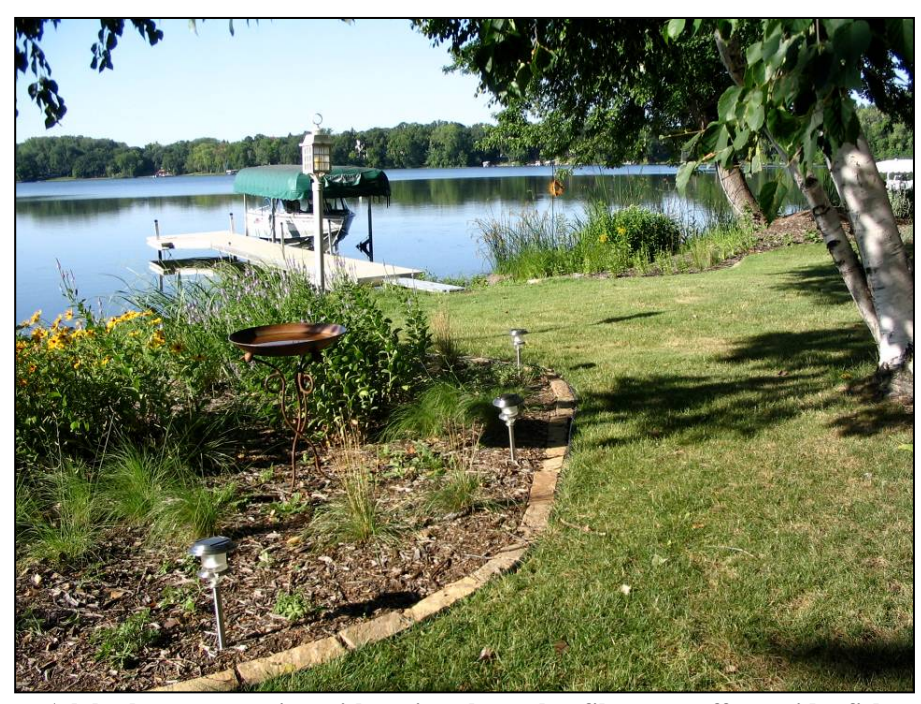
A lakeshore restoration with native plants that filters runoff, provides fish and wild habitat, and looks beautiful.

More information about the URRWMO can be found on their website at www.AnokaNaturalResources.com/urrwmo. Citizens are welcome to attend URRWMO meetings. Remaining 2009 meetings will be May 5, August 4, and November 10 at 7:00 p.m. at the Oak Grove City Hall.