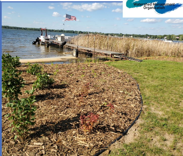
Project upon completion. August 2022.

The shore was stabilized using coconut fiber biologs and a native plant buffer. No grading was needed. Biologs were secured to 52 linear feet of shoreline. A native plant buffer was installed along most of the shoreline except for a small active use and dock put-in area. The buffer of 677 sq ft will provide long term shoreline stability and near-shore habitat.